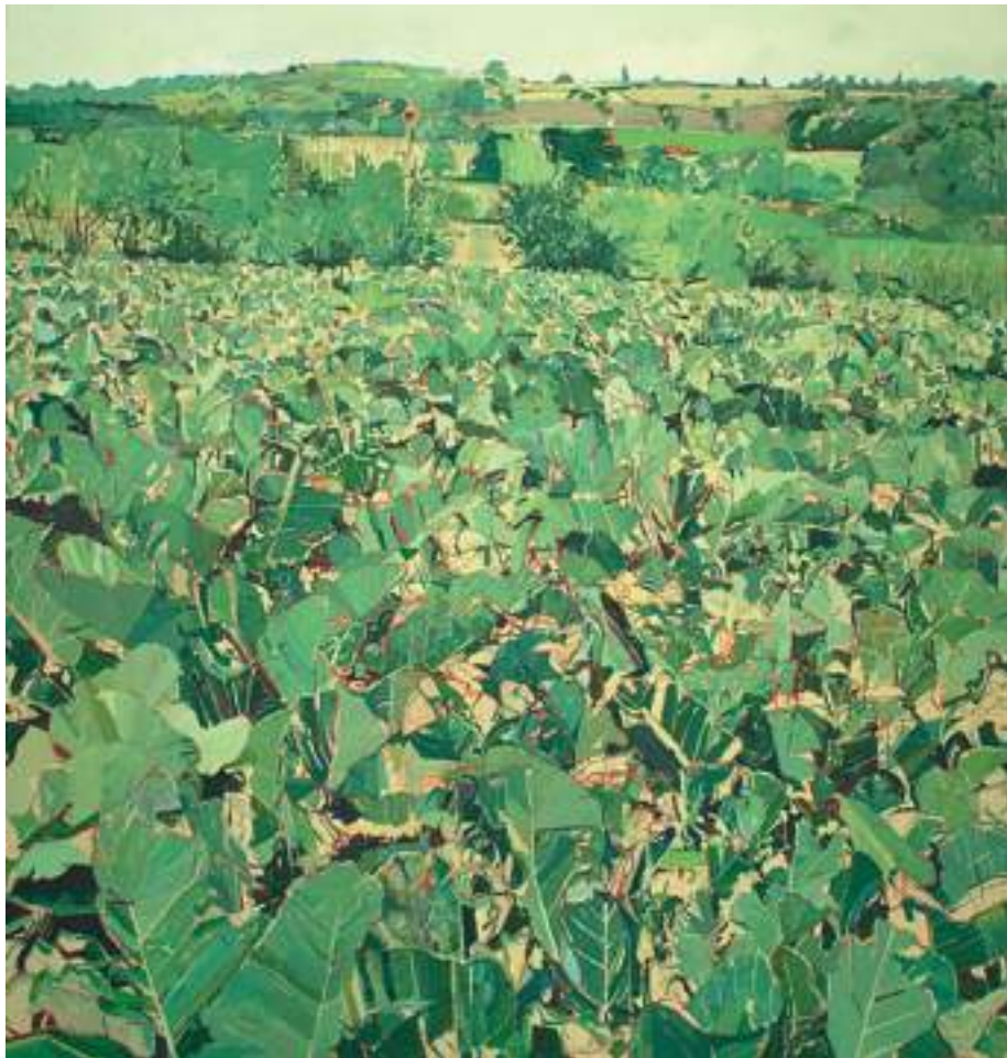
Louis Turpin View from the Studio - Cabbage Field (1979) oil on canvas — Rye Gallery Permanent Collection