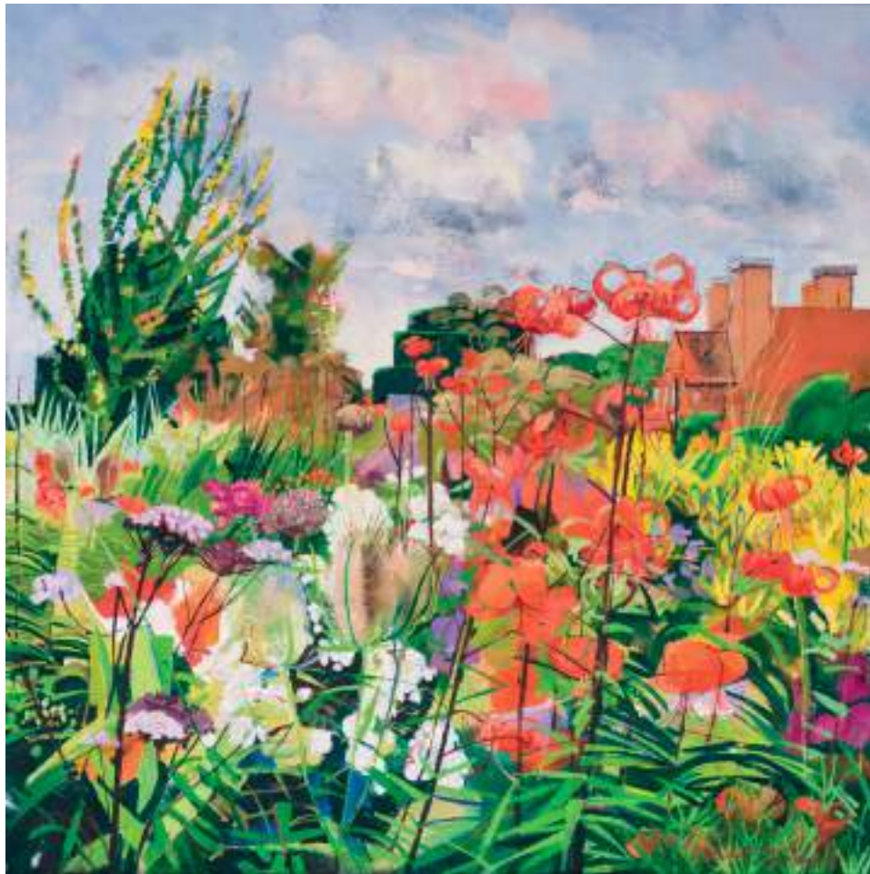
Louis Turpin Fire Lilies at Great Dixter oil on canvas 18" x 18"