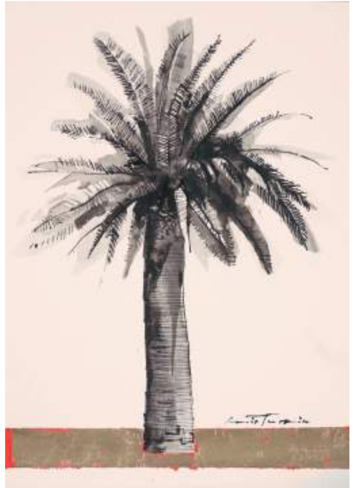
Louis Turpin Palm III ink on paper 8" x 11.5"