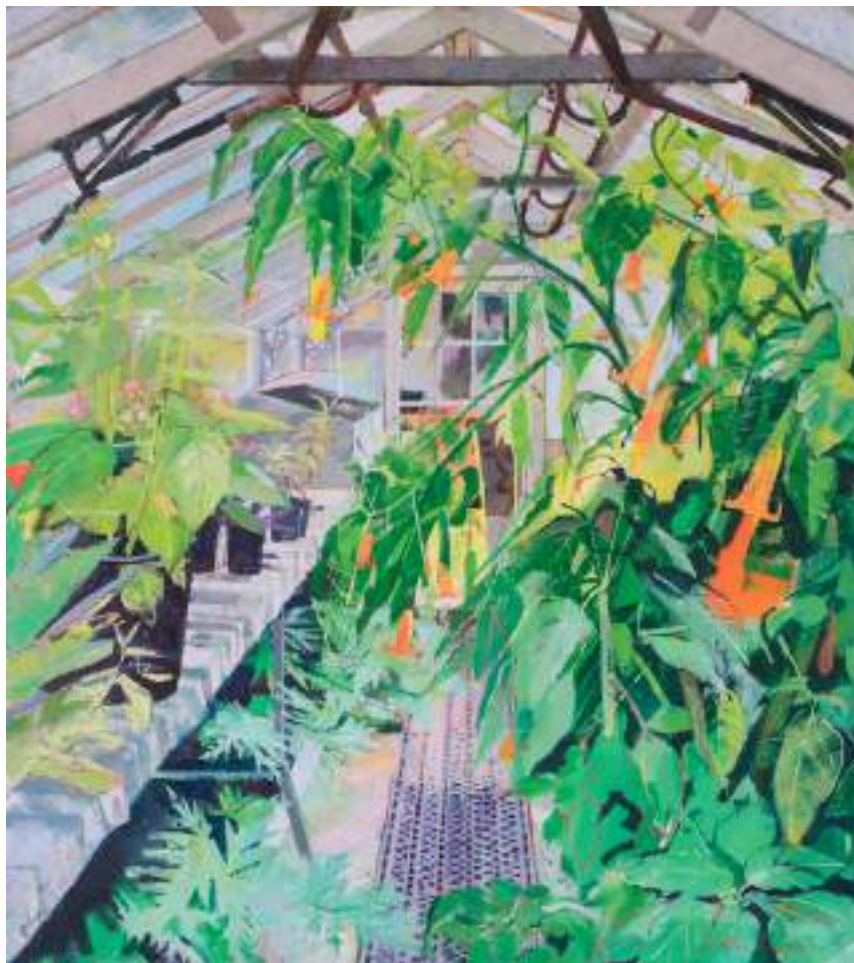
Louis Turpin Daturas in the Glasshouse oil on canvas 18" x 16"