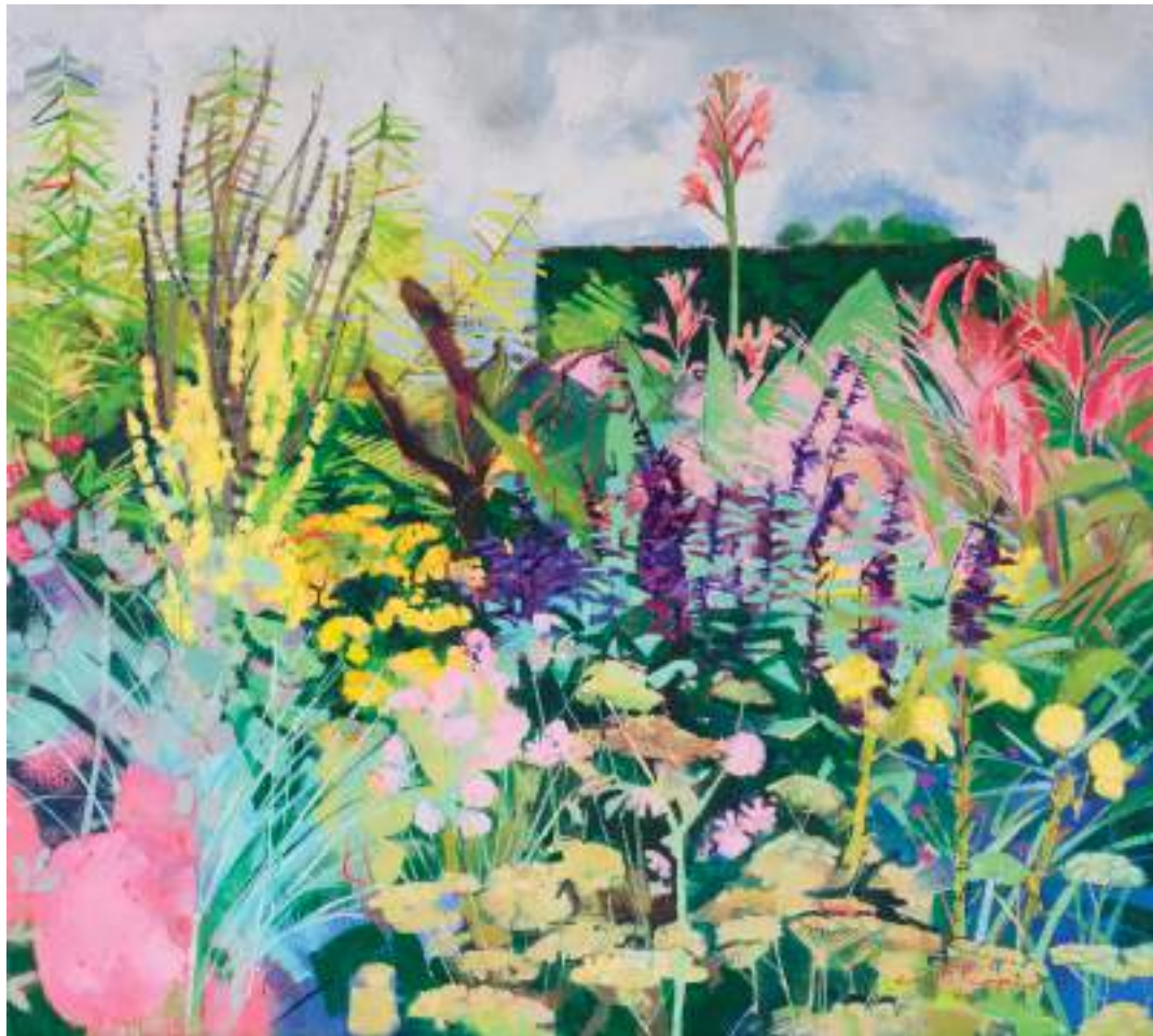
Louis Turpin The Long Border II oil on canvas 18" x 16"