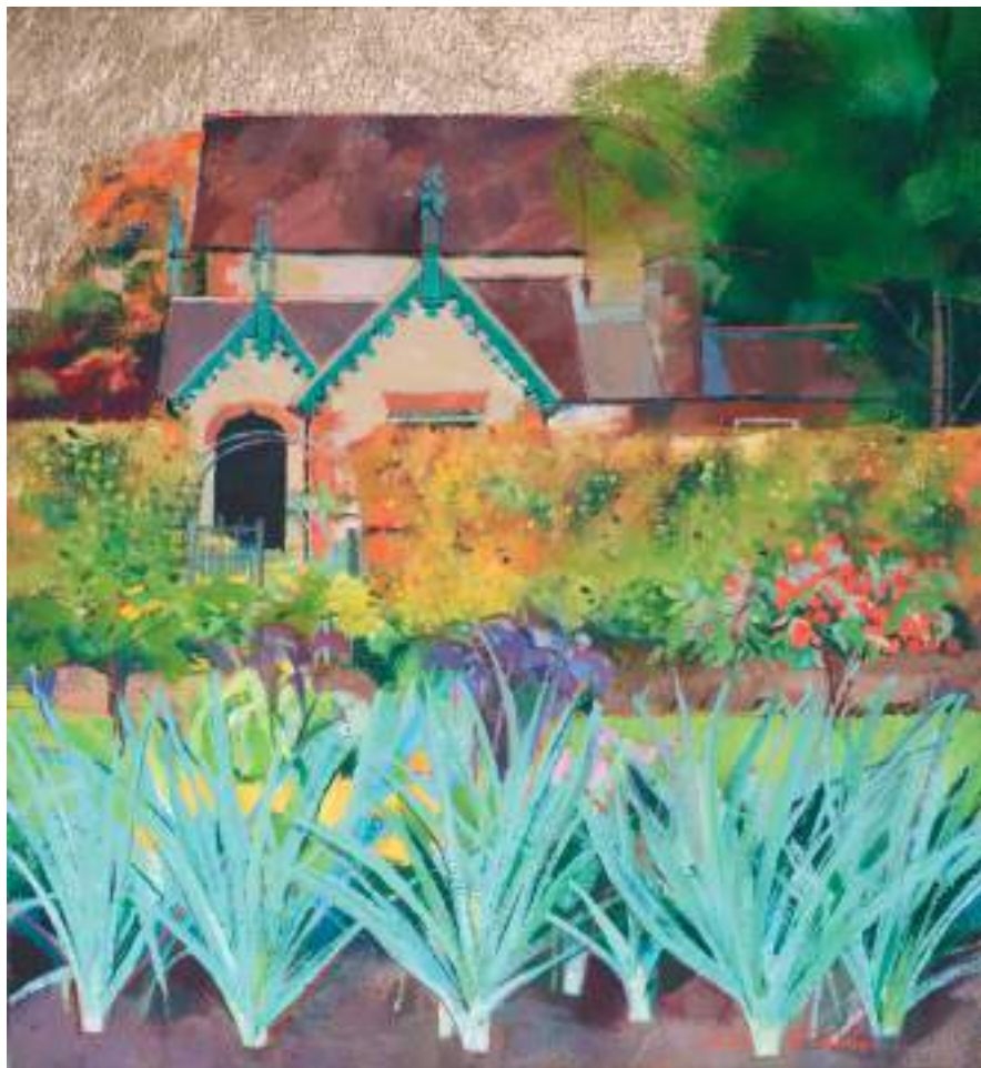
Louis Turpin The Cottage Garden oil on canvas 13" x 12"