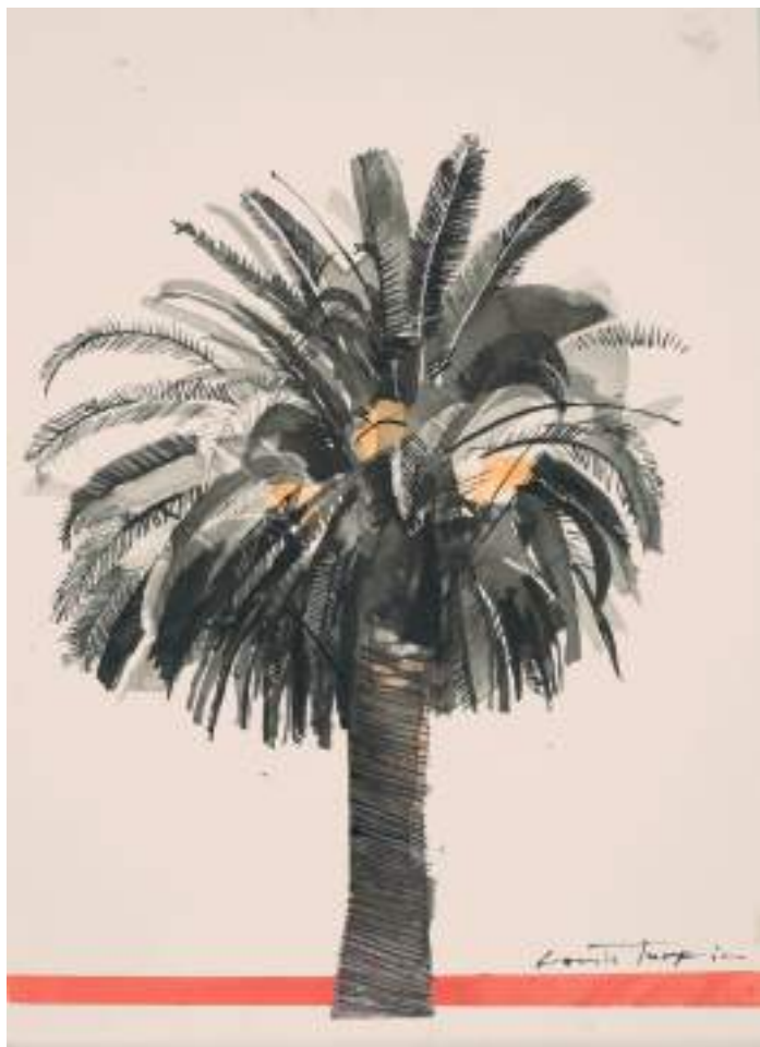
Louis Turpin Palm IV ink on paper 8" x 11.5"