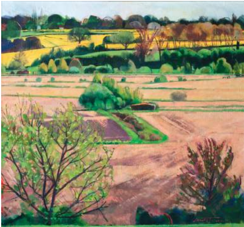
Louis Turpin View From the Studio oil on canvas 18" x 20"