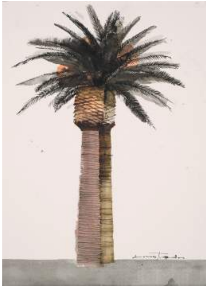
Louis Turpin Palm V ink on paper 8" x 11.5"