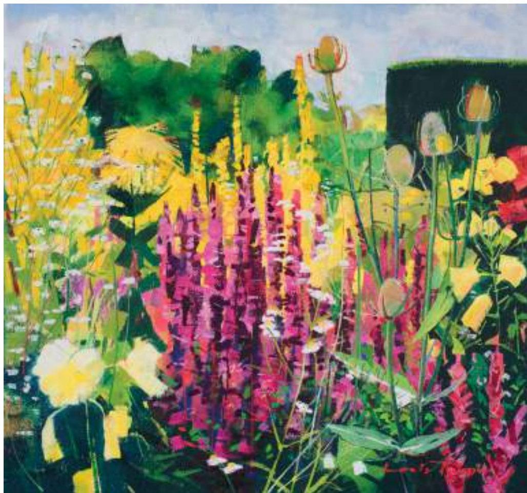
Louis Turpin Pink and Yellow oil on canvas 14" x 13"