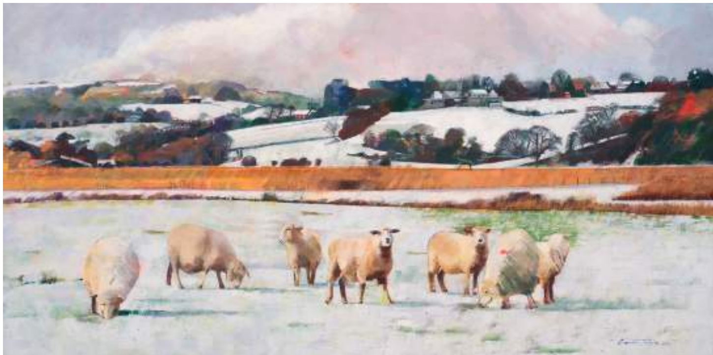
Louis Turpin Reed Beds at Pett Level oil on canvas 36" x 18"