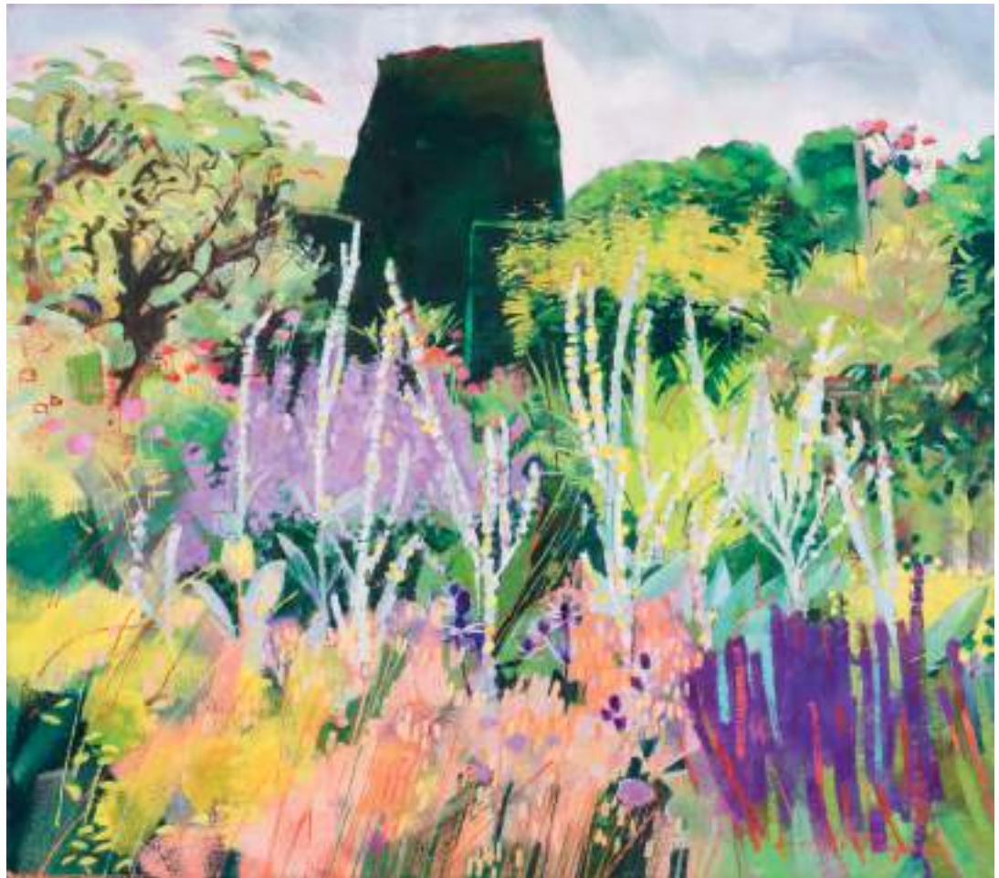
Louis Turpin The Old Pear Tree oil on canvas 16" x 18"