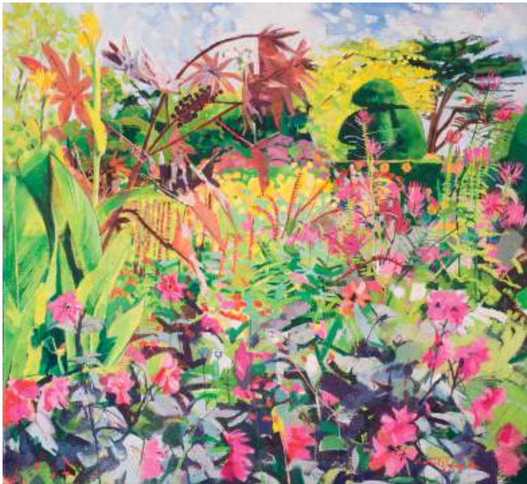
Louis Turpin Long Border, Nymans oil on canvas 15" x 14"