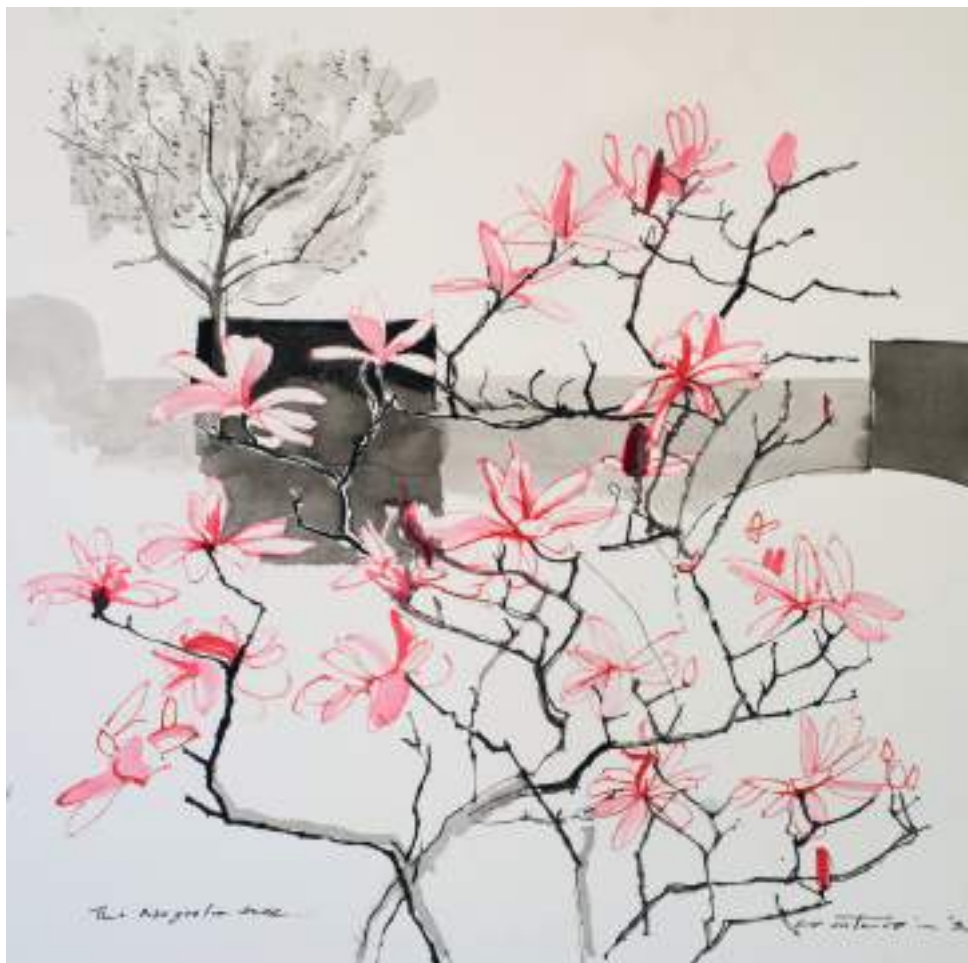
Louis Turpin The Magnolia Tree ink and brush drawing on paper 18" x 18"