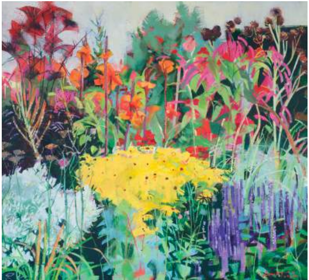
Louis Turpin The Long Border, September oil on canvas 20" x 18"